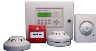
Fire Alarm System