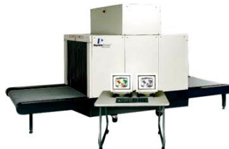
Hand, Hold & Multi Baggae Xray Machines