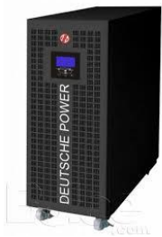
1 KVA to 40 KVA & Line Conditioners