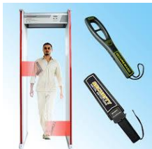
Walk Through Gates & Hand Held Metal Detectors