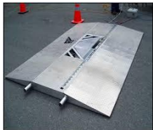
Under Vehicle Search System