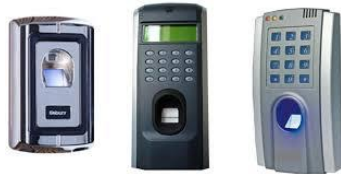
Bio metric Access Control System